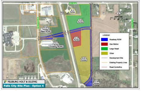
Scheduled to break ground this Summer, 33rd Street will connect Community Medical Center and our new commercial development to Hwy 73

EDGE, in partnership with the Community Redevelopment Authority (CRA), has hired Snyder and Associates to prepare a master plan for the North Hwy 73 development. The engineers will estimate utility installation costs, provide a grading plan, visual concept with proposed layout, and marketability opinions for business recruitment.