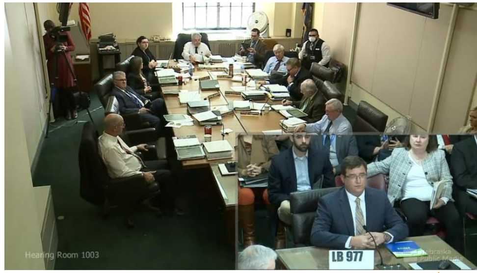
EDGE testifies in favor of LB977 to Appropriations Committee on Feb. 16th

Senator Slama's $15m power infrastructure bill passed through the Legislature with zero nay votes. EDGE is awaiting OPPD's guidance on how they wish to proceed with an application and Falls City Board of Public Works partnership. Link: Senator Slama's Legislative Update