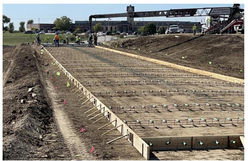
33<sup>rd</sup> Street looking West from Hwy 73 towards Community Medical Center

After 2-1/2 years of planning, construction of 33<sup>rd</sup> Street began at the end of August by Rulo Transportation, LLC. The new street will connect Community Medical Center to Hwy 73 and provide an entrance to the new commercial development east of the highway. Link: City of Falls City 33rd Street Facebook Pictures