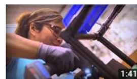
Workforce in Falls City, NE