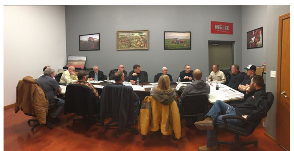
Collaboration is a key compenet in the success of the Falls City Learning Center