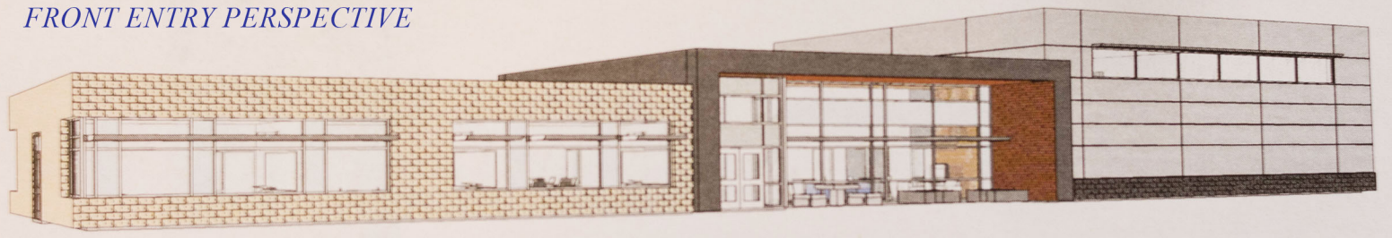
FRONT ENTRY PERSPECTIVE