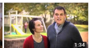
Life in Falls City, NE