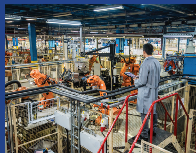
MANUFACTURING & DISTRIBUTION