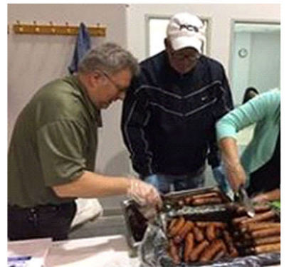
EDGE volunteers serve the crowd