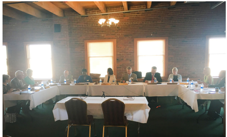
Nebraska Post-Secondary Coordinating Commission