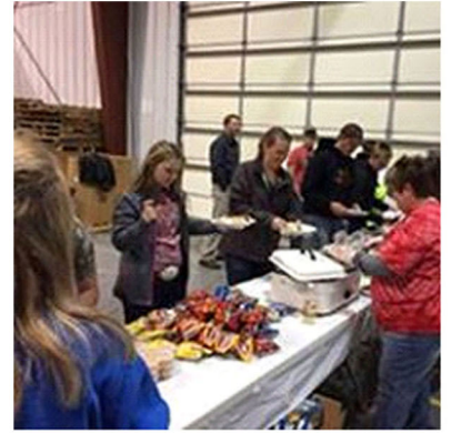
FCHS students enjoy a time out from their facility tour

In addition to the Falls City location, which opened in 2008, Vantec has a headquarter facility in Webster City, Iowa. To learn more about Vantec, visit ww.vantecinc.com . To learn more about doing business in Falls City contact the EDGE office at 402.245.2105 or email director@fallscityedge.com .