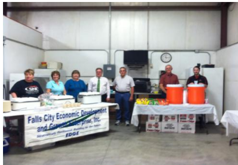
EDGE volunteers are ready to serve!