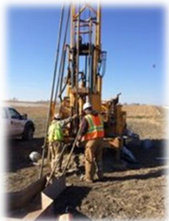
NioCorp’s Soil Geotechnical Sampling Rig, November 2014

For more information or to obtain a pre-application for Wilderness Falls II please contact Excel Development at 1-800-378-9366 or you can visit their website at http://exceldg.com/