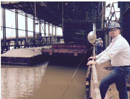
Barge Terminal in Convent, LA

We toured CGB headquarters in Mandeville, LA and heard a presentation about another sector of their business, Consolidated Terminals and Logistics Co. We were also given the opportunity to tour one of the largest Mississippi river barge terminals located in Convent, LA at the Port of New Orleans. This YouTube video highlights the facility we toured, Zen-Noh Grain, and shows you the process our agricultural products take as they enter the ports that carry food to the rest of the world via international waterways. https://www.youtube.com/watch?v=QxRcD5adx7Y