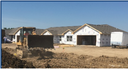
Work at the Wilderness Falls Site

Now is the time for seniors and families to contact Excel Development Group for rental information at Wilderness Falls!