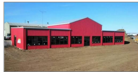
The new expansion at Merz Farm Equipment to be completed spring 2014.

The Merz Farm Equipment construction project is well underway and they are excited about the significant investment they are making in the future of Falls City. The planning effort for this project began in 2011 and after much due diligence and planning, the Merz family unveiled their plans for expansion during their 60 th anniversary open house in June of 2013. The project includes a design built with a focus on serving their customers and includes a new office building, customer lounge and, for the viewing pleasure of their customers, a state of the art showroom big enough to display an array of Massey Ferguson products and equipment. Merz Farm Equipment also plans to maintain an expanded product offering, construct a brand new service office and conference room in order to better serve the immediate needs of their loyal customer base. This new facility will give their staff an ideal environment to gain the skills and knowledge to better serve the customer and will provide the service techs all the tools they need to make sure farmers are in the field and running at all times. It's a great project for Falls City and it will have a positive impact on our agricultural community. Look for a grand opening event sometime this spring!