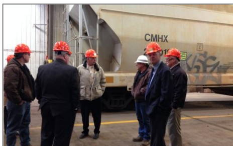
SCC's assessment team toured Herzog as part of our local evaluation.

Falls City industries, including WASP, Airlanco, and Herzog, are among those employers that will become part of those national averages as they look to grow and expand in 2014 and beyond. Their need for welders is great and therefore a unique partnership is being created among Falls City EDGE, Southeast Community College (SCC), Falls City High School and our local industries via SCC's customized training division. Our mission is to design, develop and deliver a welder training program that will assist our local industries in meeting their employment growth projections.