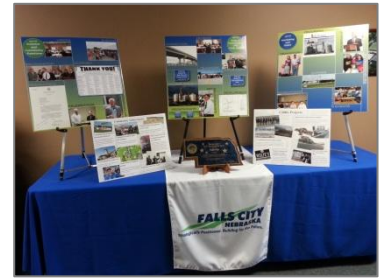
2013 Top Highlights

The banquet is an annual event that brings together so many volunteers who do so much for the community. EDGE’s top accomplishments for 2013 were showcased in a display and the 2013 Annual Report was distributed to investors at the meeting. The most notable success stories of 2013 included a historic week that included grand opening celebrations of two 20+ million dollar projects including the Missouri River Bridge at Rulo and Consolidated Grain and Barge. Hundreds of area citizens attended the events. Not many rural communities of our size in the nation can say they celebrated projects of that scope and magnitude in one week. The report also highlighted strong manufacturing growth with 3 local industries at 5 year employment highs, the record membership of Falls City EDGE at 161 investors, adding to the next generation workforce via the InternNE program , construction of new single family homes, small business growth, the multiplier effect of the CGB construction project and much more.