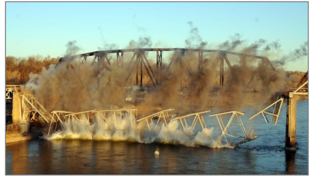
Demolition of the first section of the old Rulo bridge.