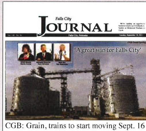
CGB: Grain, trains to start moving Sept. 16