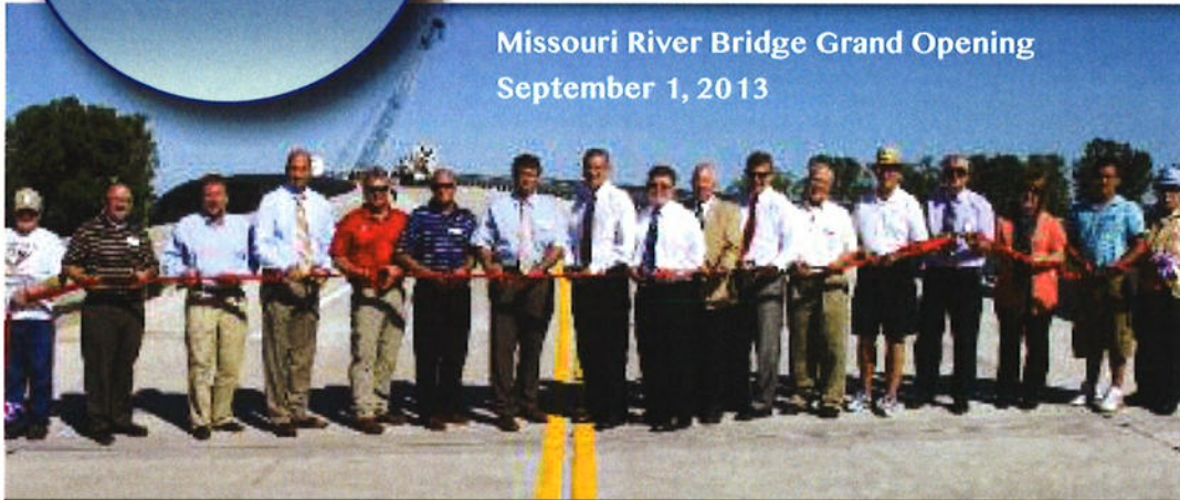
Missouri River Bridge Grand Opening September 1, 2013

"The Bridge Project truly is an amazing effort and is the kind of game changer, today and far into the future, that will matter to so many for so many purposes across southeast Nebraska, the tri-state area, and well beyond. The movement of people and commerce to and from everywhere will be able to depend upon a safe and modern connection. You have opened the door wide! An excellent effort to accomplish an epic project! Every accolade is absolutely earned and deserved!"