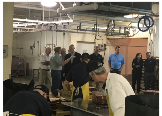
Governor Ricketts tours Falls City Foods