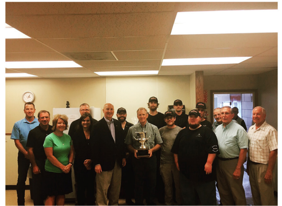
Falls City Foods shares in the Governor's Cup Tour

“Economic development is a competitive environment,” said Ricketts. “We must continue to work to build new competitive advantages to keep Nebraska the best place in the world to live, work, and raise a family.”