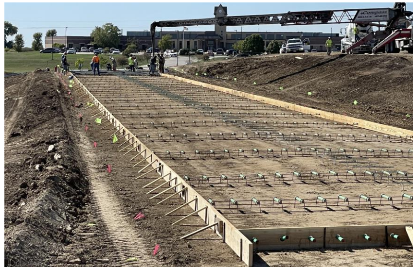
33 rd Street looking West from Hwy 73 towards Community Medical Center

Link: City of Falls City 33rd Street Facebook Pictures