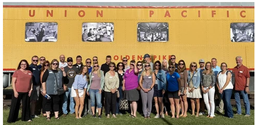
Leadership Nebraska's 14 th Class tours Bailey Yard in North Platte.

Leadership Nebraska Class XIV Press Release