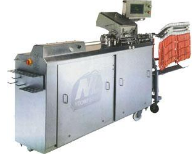
“Frank-o-matic” hot dog machine.