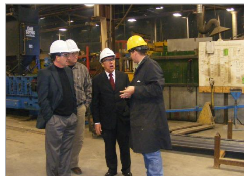
EDGE, City and State Officials Tour AGI's Westfield Industries Facility in Canada