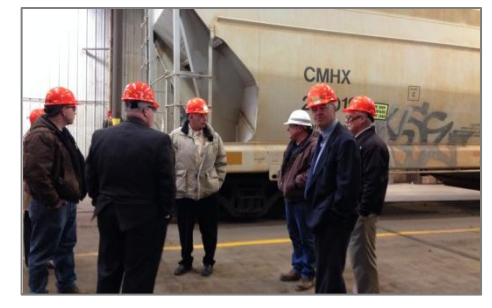
SCC's assessment team toured Herzog as part of our local evaluation.

Southeast Community College's welding assessment team recently toured our high school industrial arts lab and our industries in order to devise an advanced welding program that will meet the needs of our industry by providing technical skills to industry applicants. This coordinated effort will create a pipeline of qualified applicants for our industries and we look forward to launching this program in May/June of 2014. The program will include 40 welding lab hours as well as 20 hours in the classroom. For more information about the upcoming program contact the Falls City EDGE office at 402.245.2105 or director@fallscityedge.com.