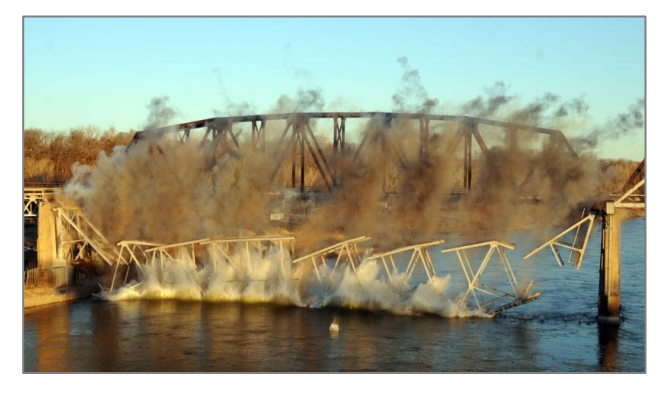
Demolition of the first section of the old Rulo bridge.