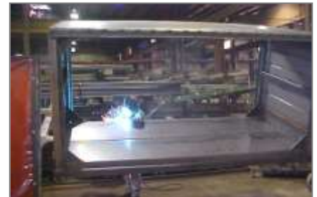
WASP worker putting finishing welds on bag cart for FedEx