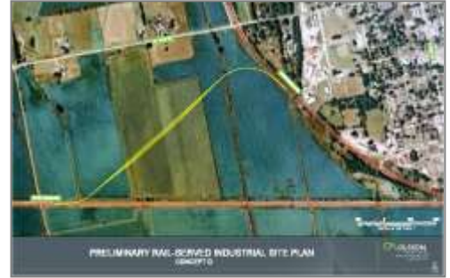
Preliminary site plan for proposed Falls City dual rail-served industrial park