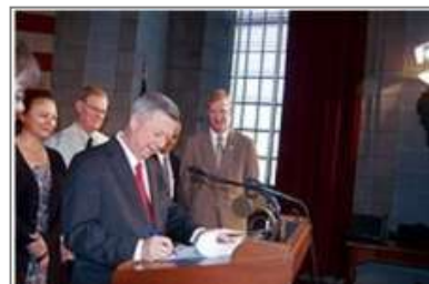
Gov. Heineman signing LB1048

Several bills were signed into law to boost economic development in Nebraska, including LB1048 —the Wind Energy Bill designed to encourage the development, ownership and operation of renewable energy facilities for the export of wind energy from Nebraska, and preserves the benefits Nebraskans receive as a result of the state's unique public power system by allowing the Nebraska Power Review Board to approve wind energy operations designed to export energy.