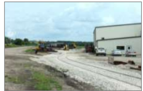
Herzog adding more than 3.5 miles of rail trackage to increase capacity at Falls City rail car repair facility

Visit Herzog’s website to learn more about the company and its Falls City operations »