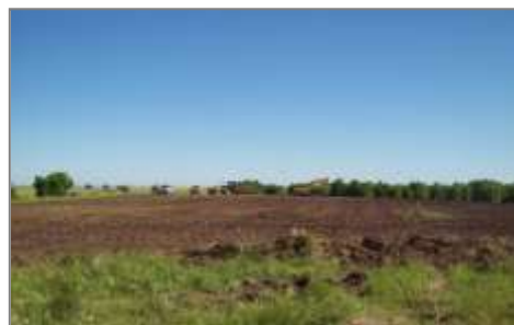
Preliminary construction work starting on wind farm

The project size is 60 mega-watts consisting of 40 General Electric 1.5 MW wind turbine generators. Power will be purchased by OPPD under a power purchase agreement. The project is situated entirely in Richardson County, NE.