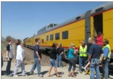
Falls City Middle School students board Operation Lifesaver train

Union Pacific brought the Operation Lifesaver train to Falls City and other communities in Southeast Nebraska in April as part of an education effort aimed at reducing the number of deaths and injuries at railroad crossings and railroad rights-of-ways. Approximately 500 Falls City adults and children, including Falls City Middle School students shown in the photo, boarded the train for a trip to Stella, NE and back to Falls City.