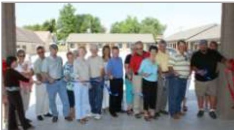
Vision Inn Motel ribbon cutting ceremony

In May a large group of community leaders and citizens gathered for the ribbon cutting ceremony and a tour of the newly-expanded Vision Inn Motel.