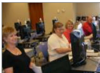
Twenty local businesses and young entrepreneurs participated in social media workshop

EDGE, in collaboration with the Falls City Chamber of Commerce/Main Street and the University of Nebraska-Richardson County Extension Office, sponsored a social media workshop for local businesses and entrepreneurs in June. Twenty individuals participated in the workshop to learn how to utilize social media tools and technology applications, including Facebook, Twitter, LinkedIn, Skype, blogging and others, to market their business.