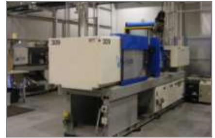
Vantec work center