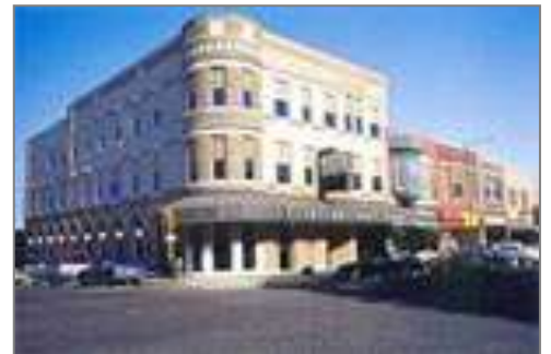
Falls City's Downtown District