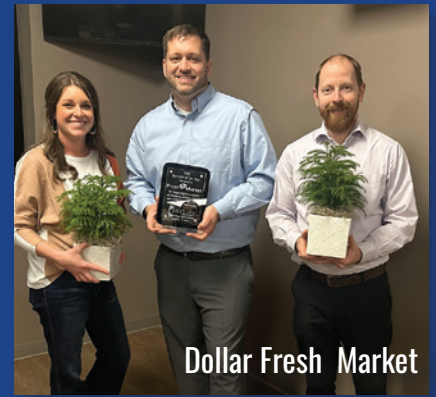
Dollar Fresh Market